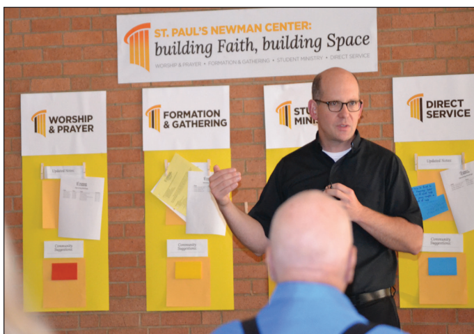
One of 6 presentations to evaluate needs